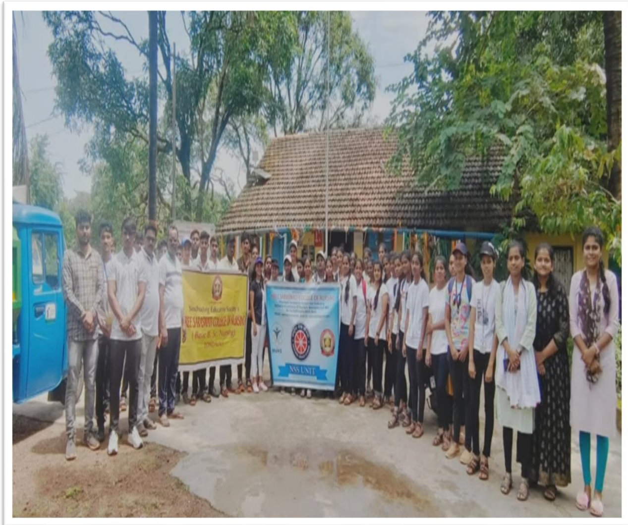
Participation of Principal Madam and Teaching Staff in Swachha Bharat Abhiyan.